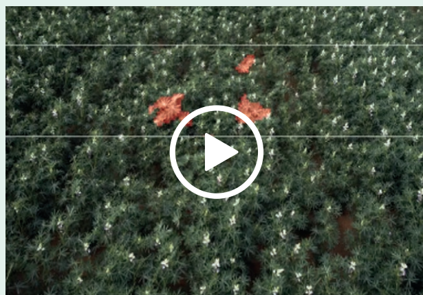
What does the application see?

The application is able to pick up the blue lupins when the leaves are visually different from the crop. For best results, we recommend to target the weeds from 4-5 leaf stage onwards when their oldest leaves are wide, open and visual. To maximize the detection, the application is also able to detect the blue lupin flowers in addition of the leaves.